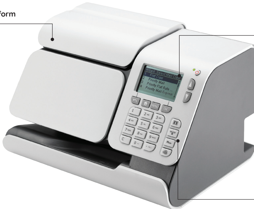
3. Shortcut Keys