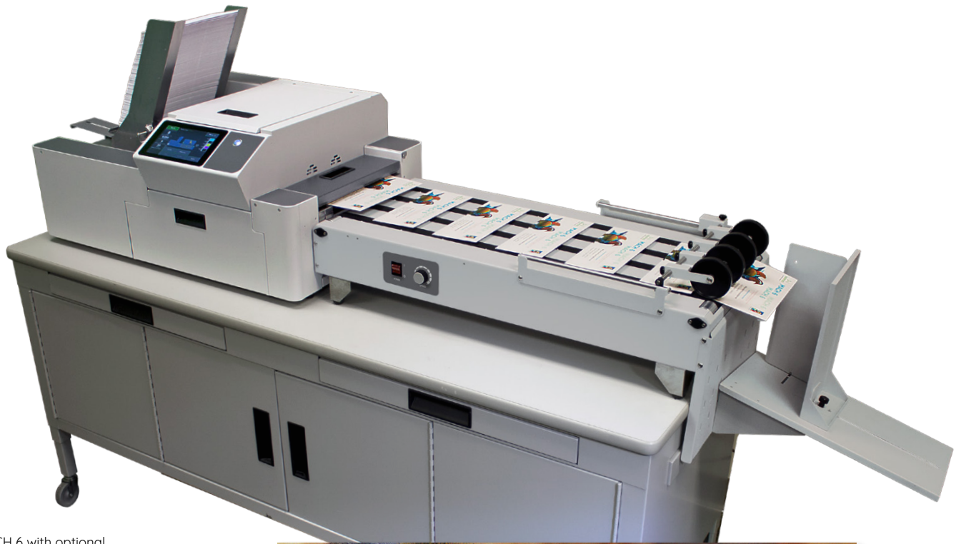
MACH 6 with optional conveyor stacker & cabinet base