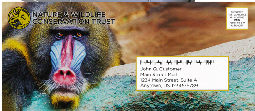
Actual scan of a full-bleed example printed on the MACH 6